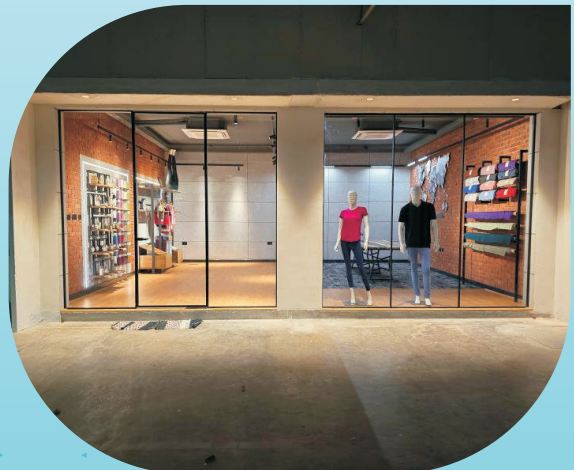
Products displayed inside the studio