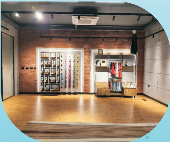
Customer - Lounge inside the studio